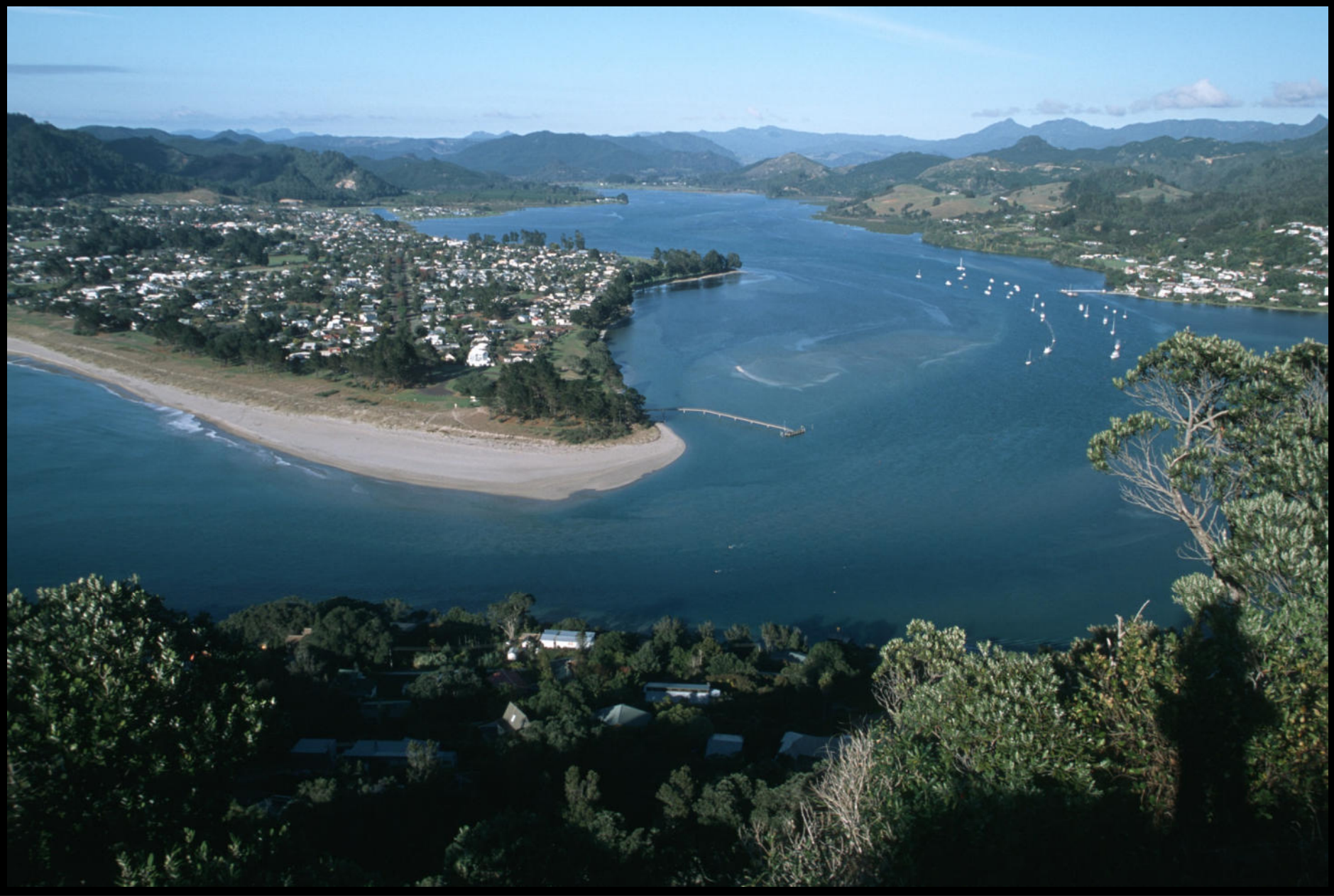
☺ Welcome on Aoteora, where nature spreads its wild palette of colors and firms voluptuously. ☺ New Zealand - land of the long, white cloud - shows its typical soul during the view from Paku Hill nearby Tairua (Coromandel) – April 2013