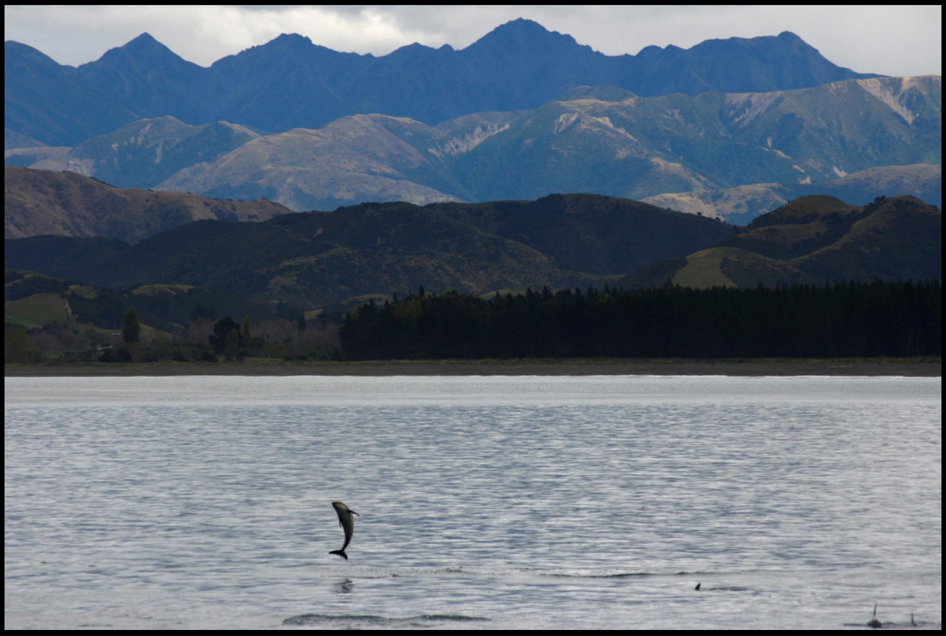
🌀 Jump courageously and curiously out of the water, befor you submerge again. It is worth it. 😊 A swarm of hector dolphins amazes us with their artistic flight and hunting skills off the coast of Kaikoura (NZ South Island) – April 2013